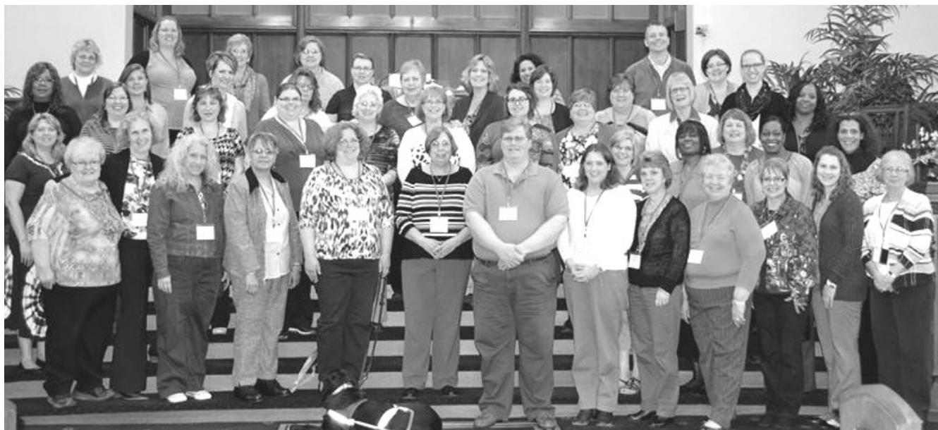
2015 UCC Office Support Staff Network (UCCOSSN) Annual Conference, Plymouth Church, Fort Wayne