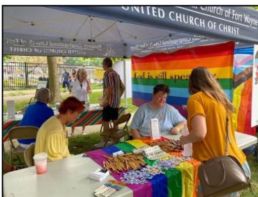
Plymouth Church's booth at Fort Wayne Pride in 2022.