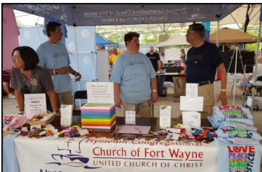
Plymouth Church's booth at Fort Wayne Pride in 2017.