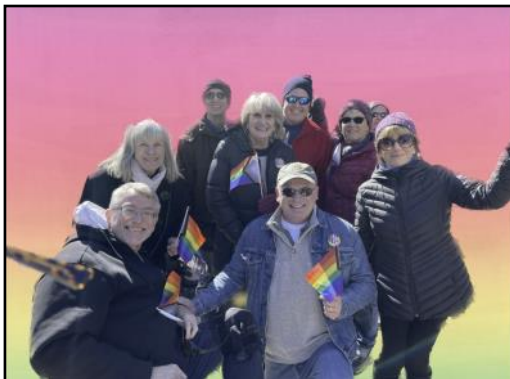
Plymouth members and friends at the No Hate in Our State rally in March 2023.