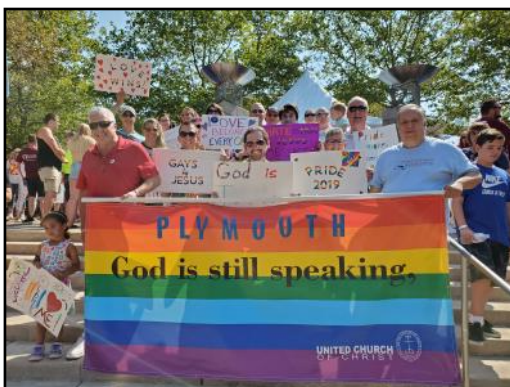
Plymouth members and friends at the 2019 Fort Wayne Pride March.