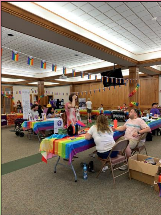
Resource tables in the Folsom Room at the 2022 Pride at Plymouth.

For the most up to date information about Pride at Plymouth and the Pre-Pride Drag Workshop, follow us on Facebook (@plymouthchurchfw) and Instagram (@plymouthchurchfortwayne).