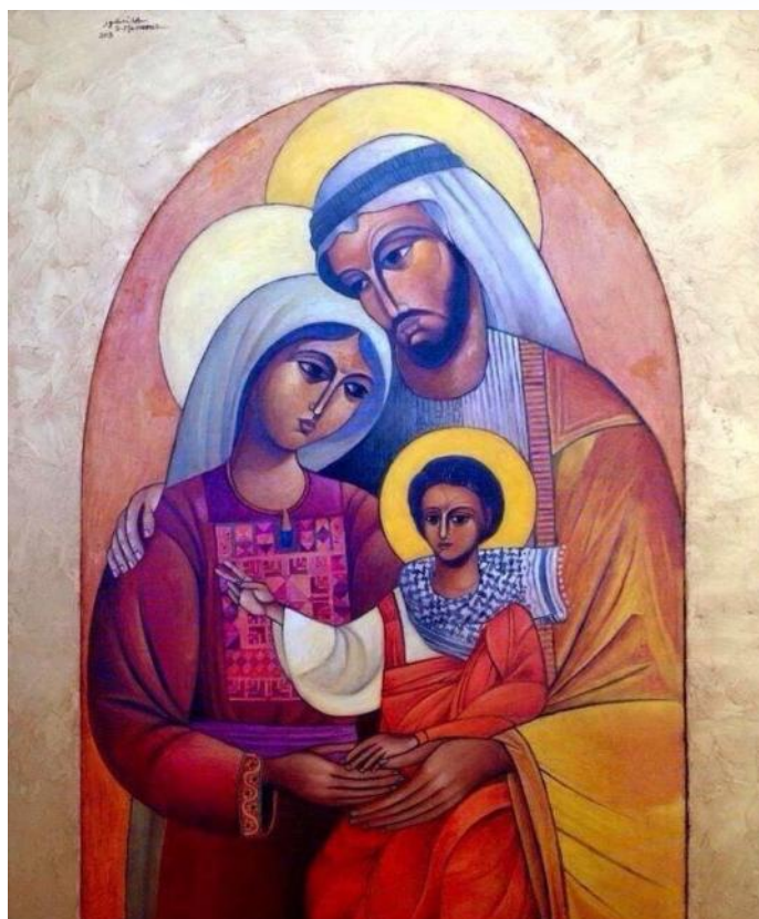
The Holy Family, by Sliman Mansour